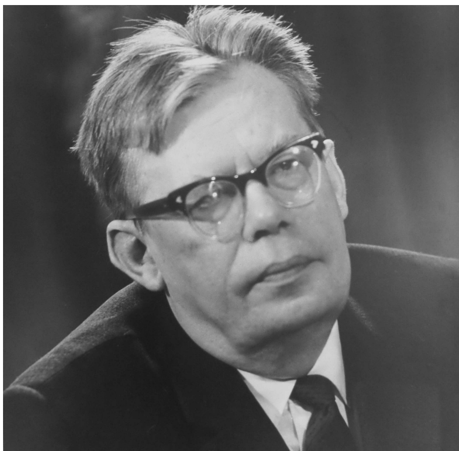
M.M. Bogolyubov 21.08.1909–13.02.1992