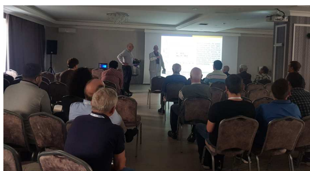
“New Trends” in Odessa. Credit: A. Burgazli