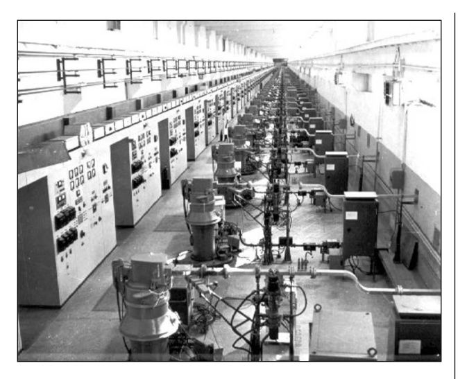
Linear electron accelerator at 2 GeV