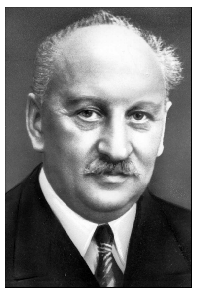
Academician A.F. Ioffe, the initiator of the UPTI foundation

The rapid pace of UPTI building was induced by the state slogan at that time "To catch up and overtake the economically developed countries of the world". So, the state did not spare money for science. In order to build unique laboratory premises, the government even allowed the dreadnought "Empress Maria", which was sunk in the Sevastopol bay in 1916, to be cut into pieces of metal.