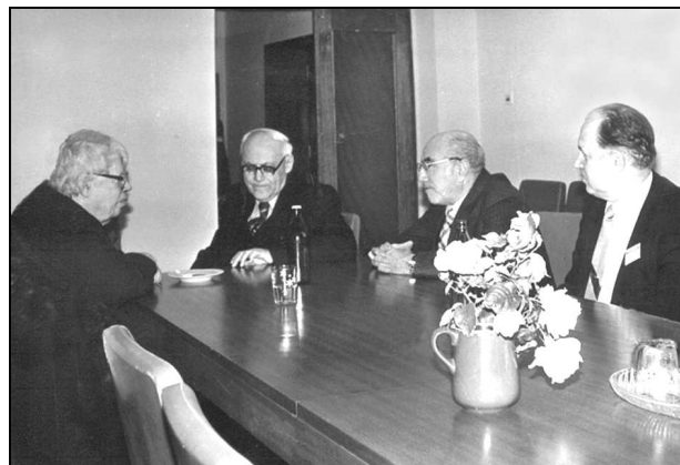
International conference on nonlinear phenomena at the Institute for Theoretical Physics of the Academy of Sciences of the UkrSSR (Kyiv, 1984). From left to right: M.M. Bogolyubov, O.I. Akhiezer, Ya.B. Zel’dovich, V.G. Baryakhtar

At present, the academic and managerial activities of Academician V.G. Baryakhtar is an example of the selfless service to Science and Motherland. As